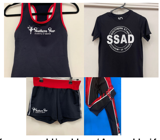
8 Years + Hip Hop/Acro Uniform

Jazz & Tap students are to wear SSAD leotard & shorts. Plus jazz shoes or tap shoes.