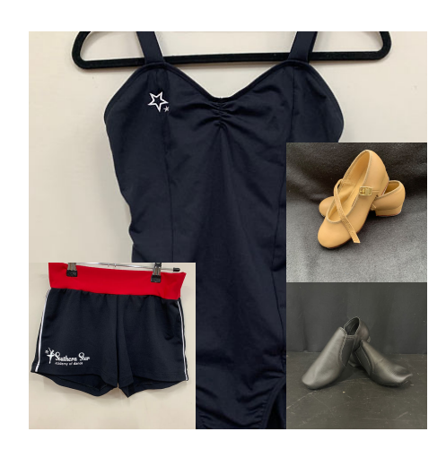
8 Years + Jazz, Tap, Contemp,

Ballet students are to wear SSAD leotard with ballet skirt & ballet shoes. Jumping Jacks will also need tap shoes. Tiny Acro to wear bare feet.