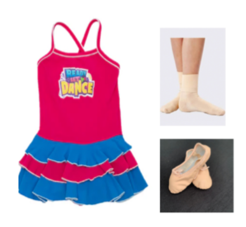
Junior Uniform 2-5 Years Movers & Groovers / Petit Pointers

All in one RSD leotard & skirt plus ballet shoes. Tiny Acro to wear bare feet.